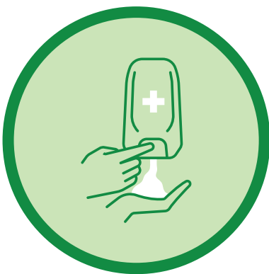
USE HAND SANITIZER